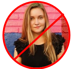
Photo Position Tips